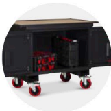
Mobile TuffBench MBH12