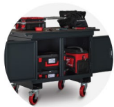
Mobile TuffBench MBH12