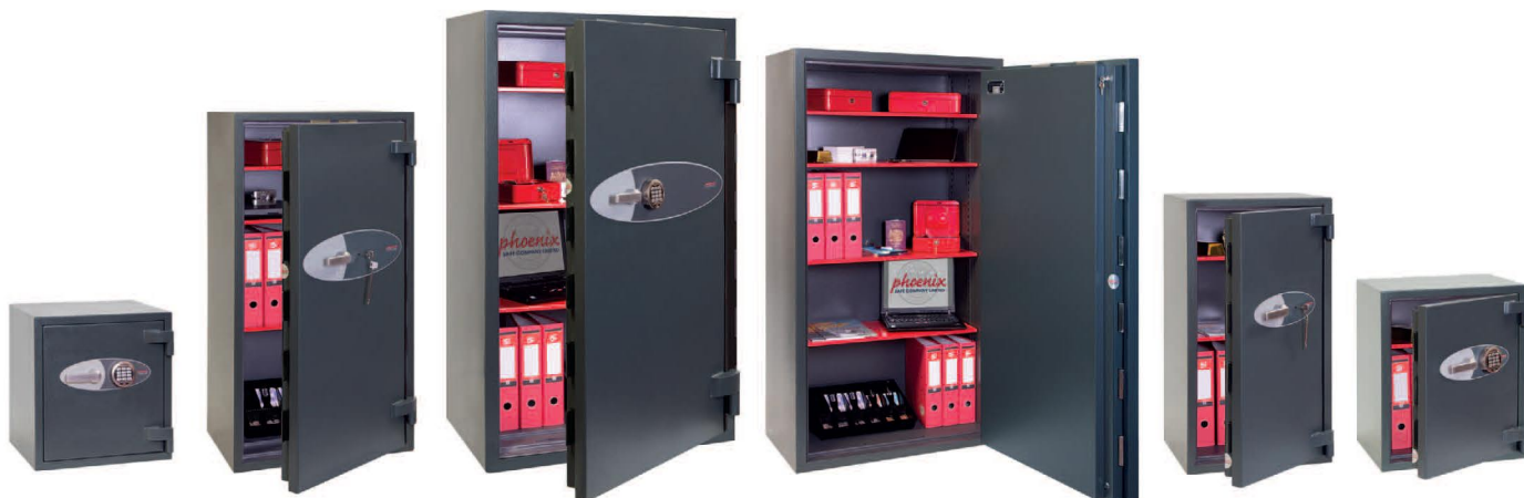
HS2051E HS2054K HS2055E HS2056 HS2053K HS2052E

THE PHOENIX MERCURY HS2050 SERIES is designed to provide extreme security protection for domestic and business use.